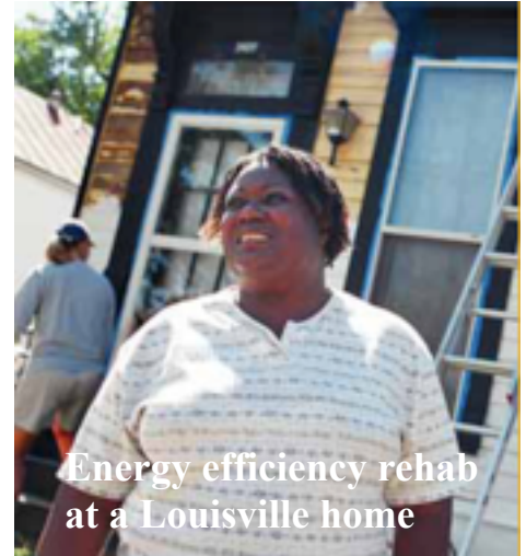
Energy efficiency rehab at a Louisville home

Creating the incentives necessary for utilities to invest in energy efficiency and clean renewable sources – and holding them accountable for meeting modest goals.