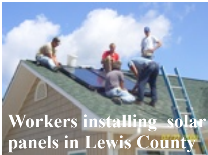
Workers installing solar panels in Lewis County

Make improving energy efficiency our top energy priority.