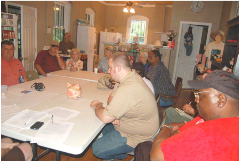
Benham and Lynch residents discussed energy issues at a roundtable meeting in late June.