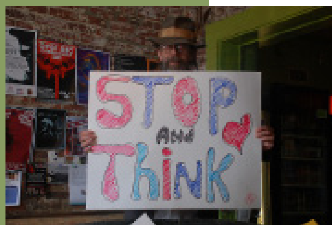
Central Kentucky members gathered in February for a whole week of activities leading up to I Love Mountains Day, including this poster making party.