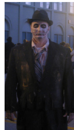
Throughout the year, KFTC members registered voters at events and store parking lots across Kentucky. In October, with the registration deadline near, some made it more interesting by dressing as zombies and carrying handbills that read "Zombies can't vote ... You can!"

Through the New Power PAC, we conducted a media campaign in the fall that focused on the secretary of state's race. We targeted the candidate whose campaign focused on limiting voting rights for the homeless, former felons and people without photo IDs. We interviewed homeless folks and former felons and published their stories on GoodDemocracyKY.org, in newspaper ads, postcards and on Facebook – telling this candidate plainly that we all benefit when everyone has a voice and a vote.