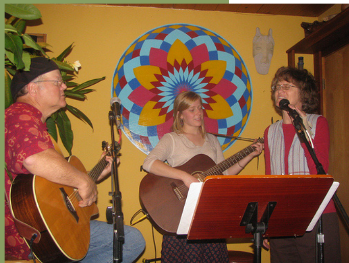
Scott County members hosted an Arty Pie Party fundraiser in November.

While using our power in six statewide campaigns, we're also building our power through New Power Leaders, grassroots fundraising, membership recruitment, and strengthening relationships with existing members.