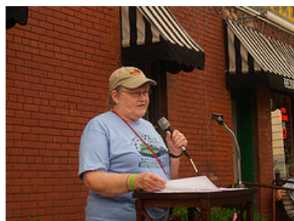
The Jefferson County chapter hosted Louisville Loves Mountains in May.

They also found time for fun and fellowship, fundraising, voter empowerment and member recruitment. They carpoled to Frankfort to lobby and supported other chapters with their presence and voices at numerous events.